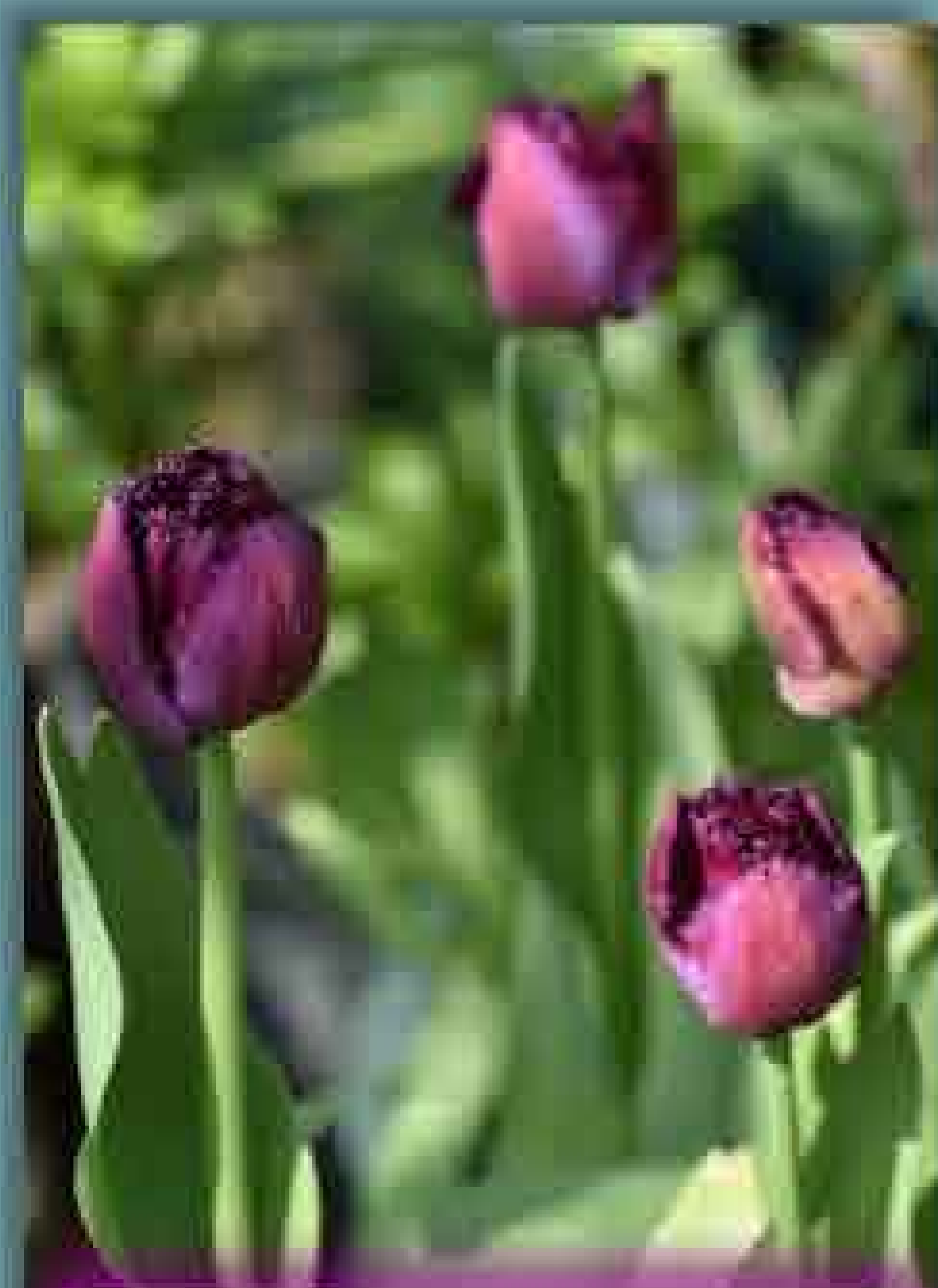
Late Spring Flowers

"We are delighted to let all our members know that we are now planning the re-opening of the Young at Heart Club."