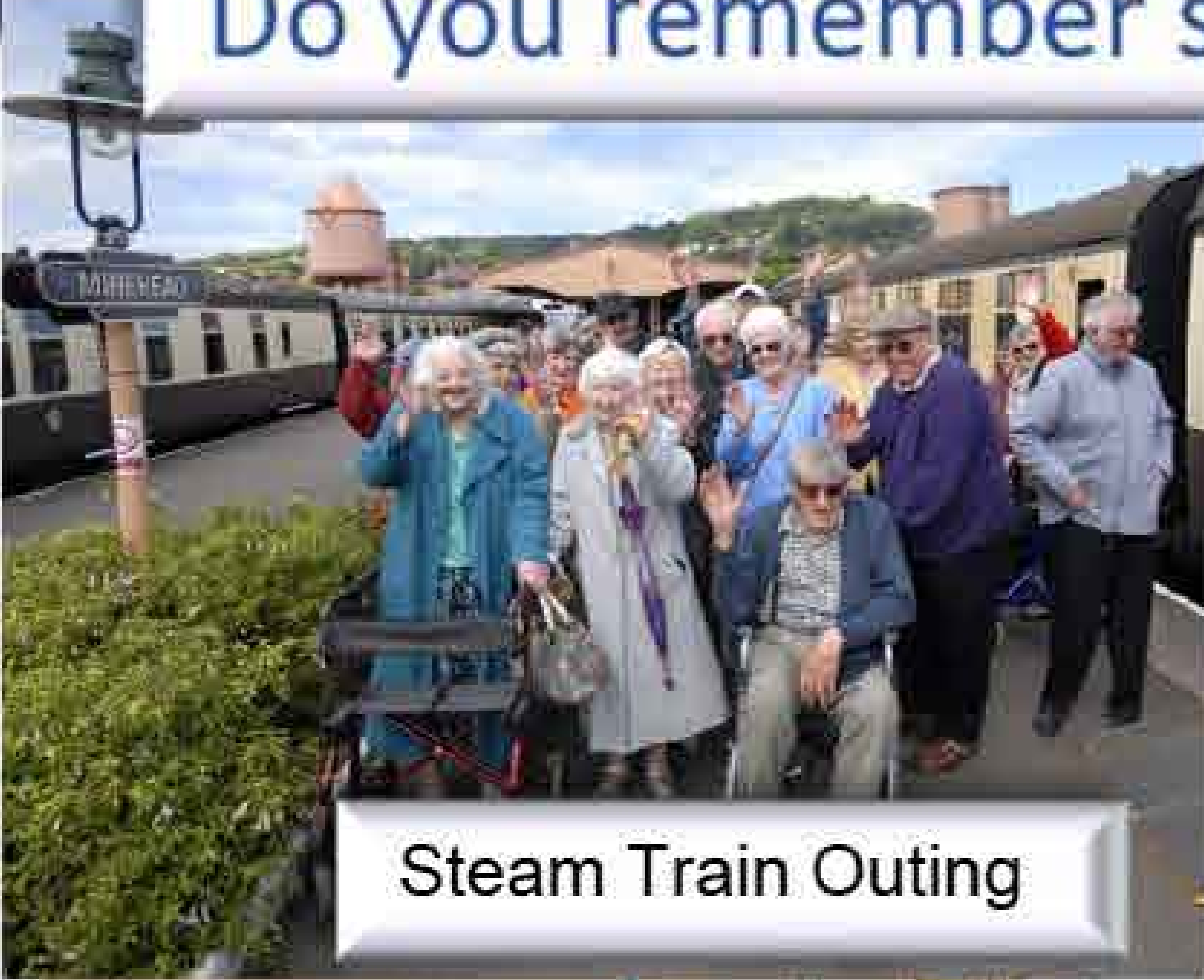
Steam Train Outing