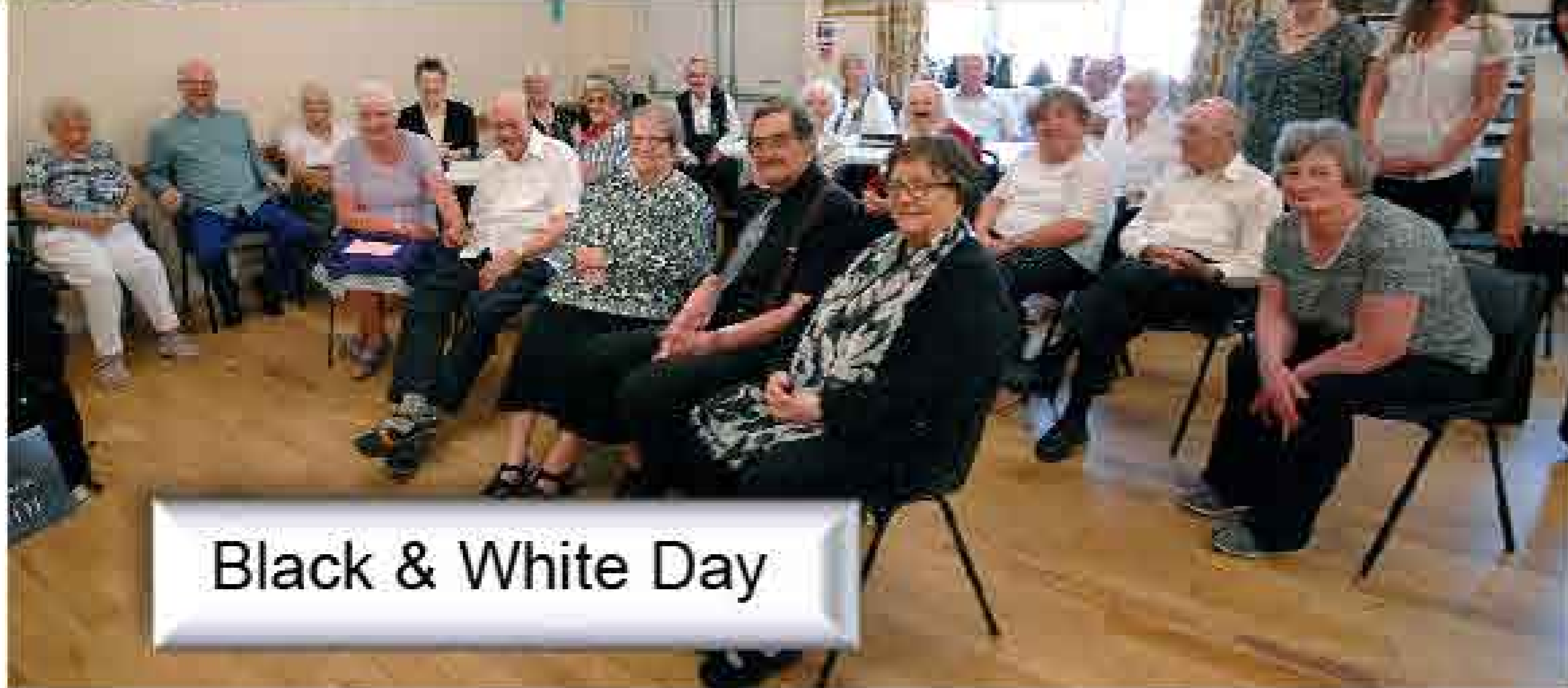
Black & White Day