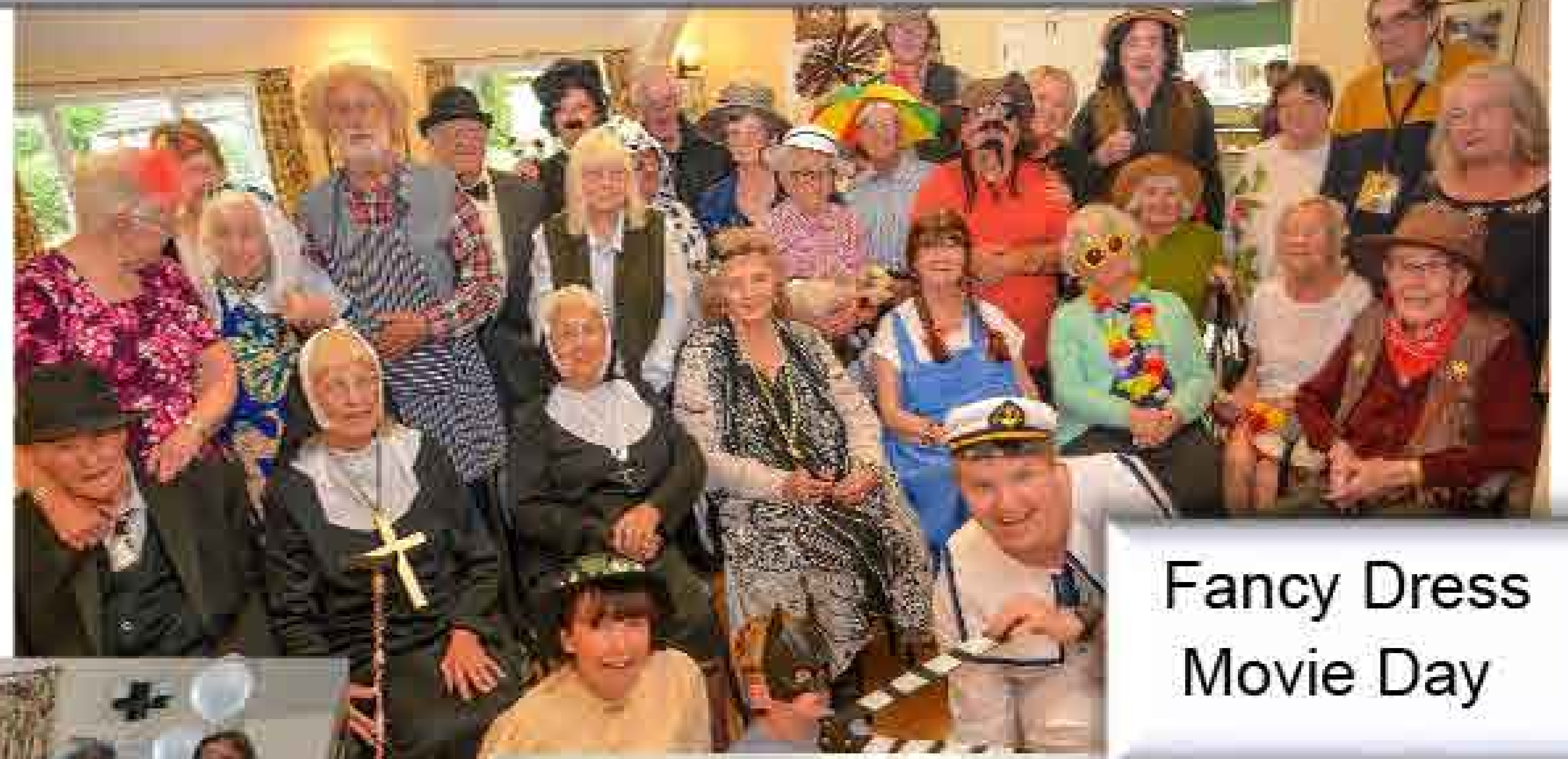
Fancy Dress Movie Day