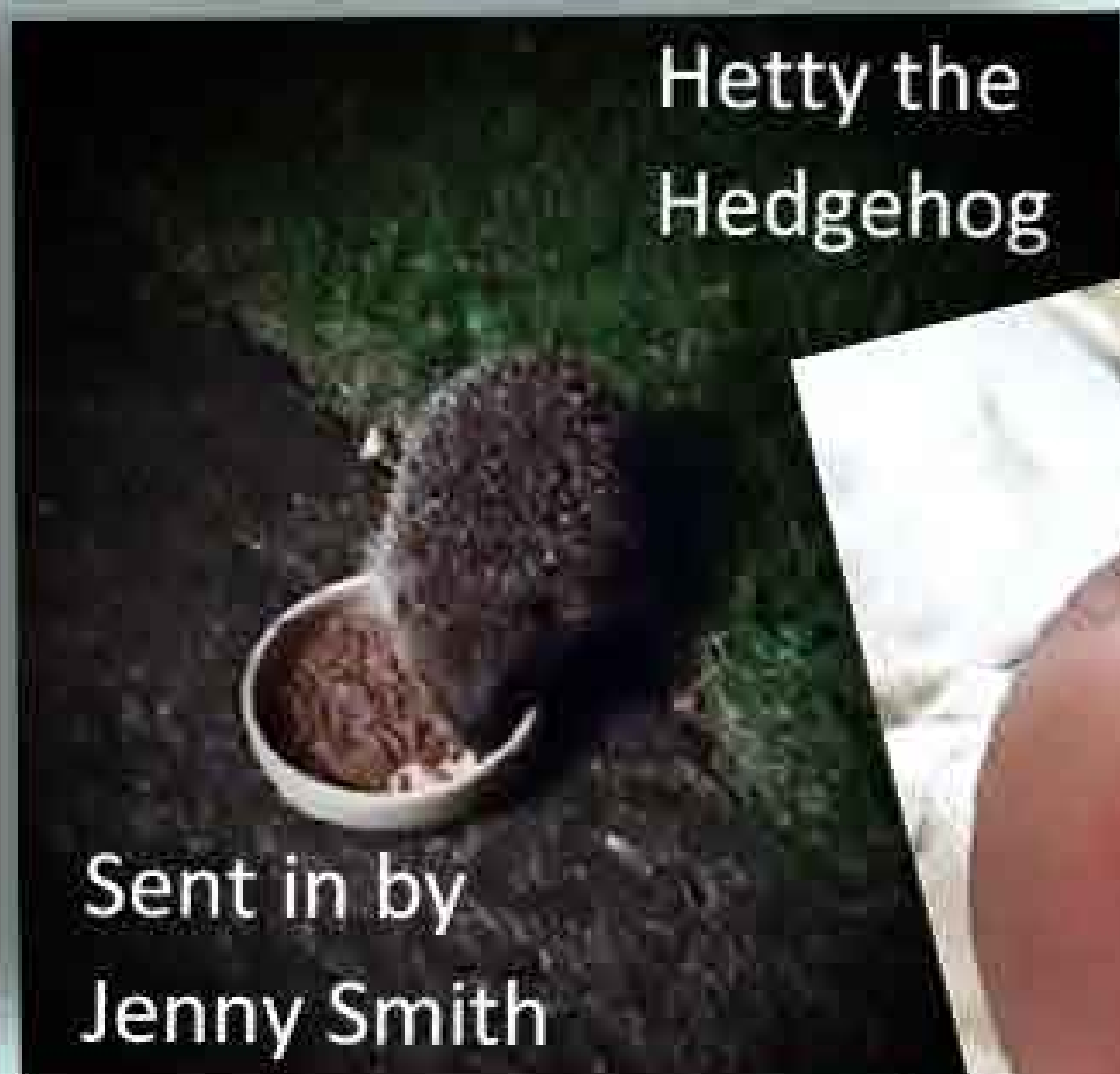
Hetty the Hedgehog