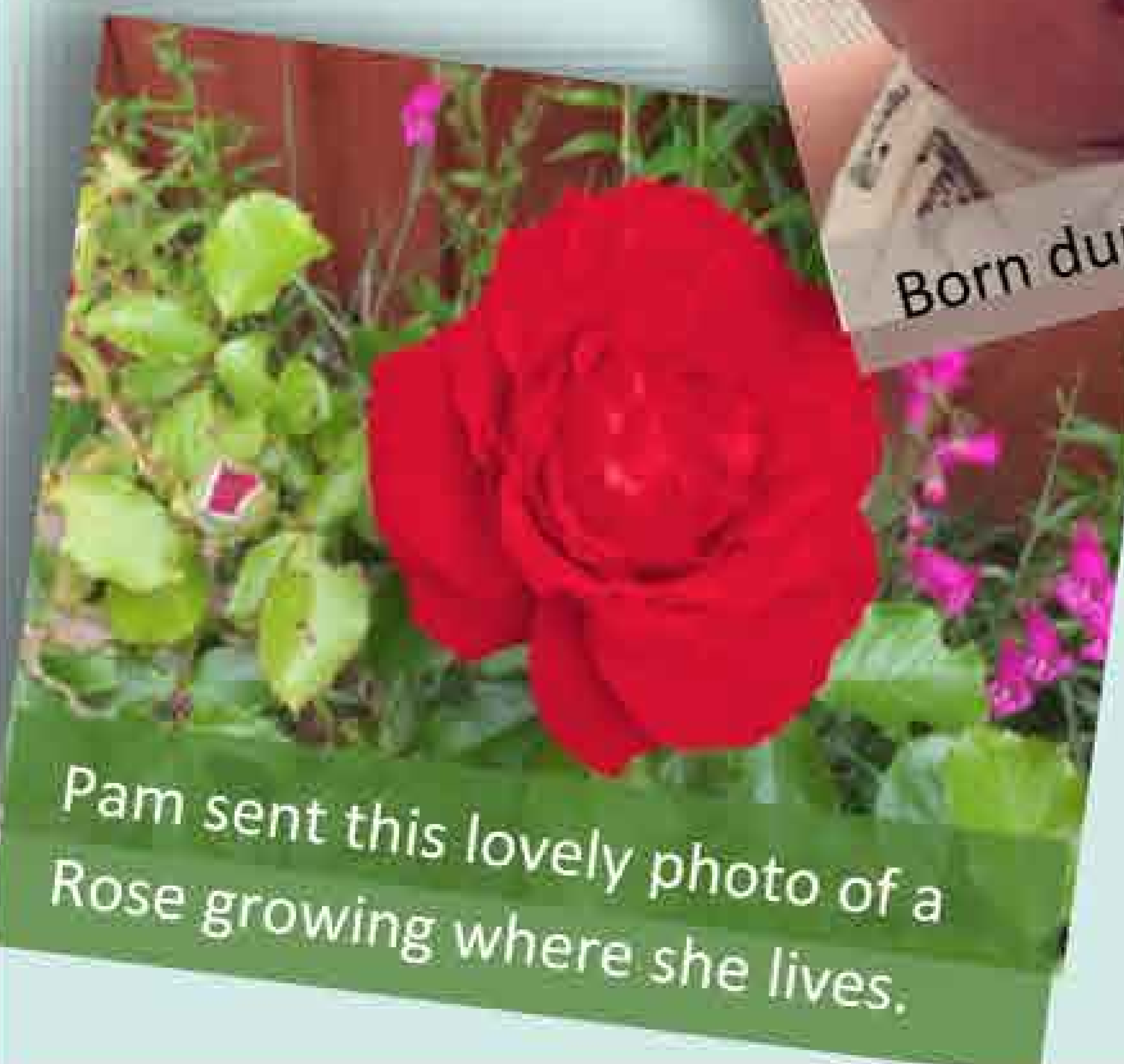
Pam sent this lovely photo of a Rose growing where she lives.