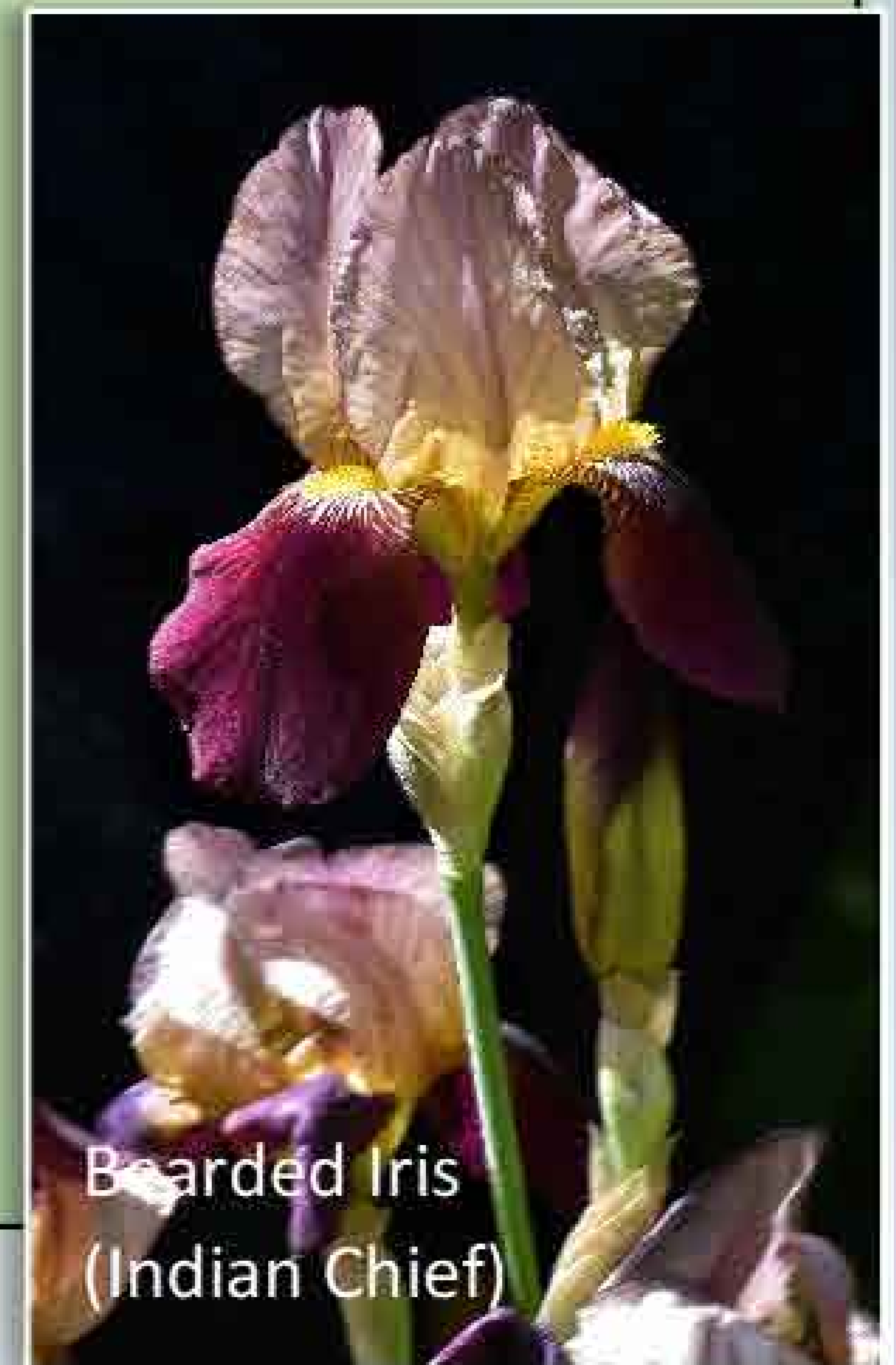
Bearded Iris (Indian Chief)