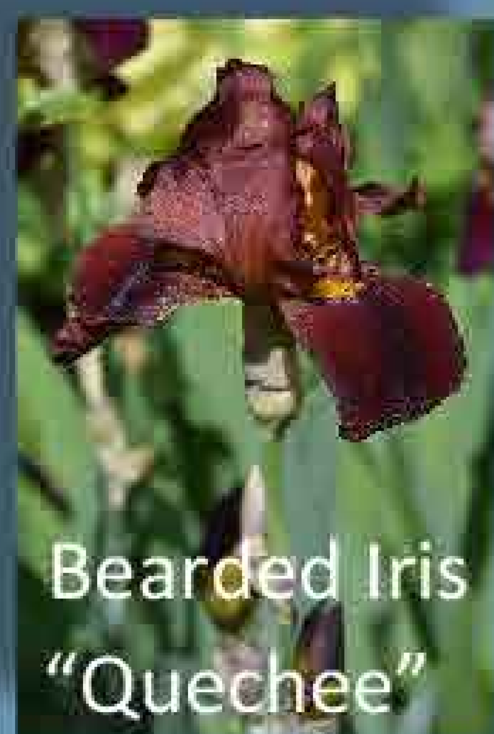
Bearded Iris "Quechee"

FUN & GAMES Games and facts to keep you amused