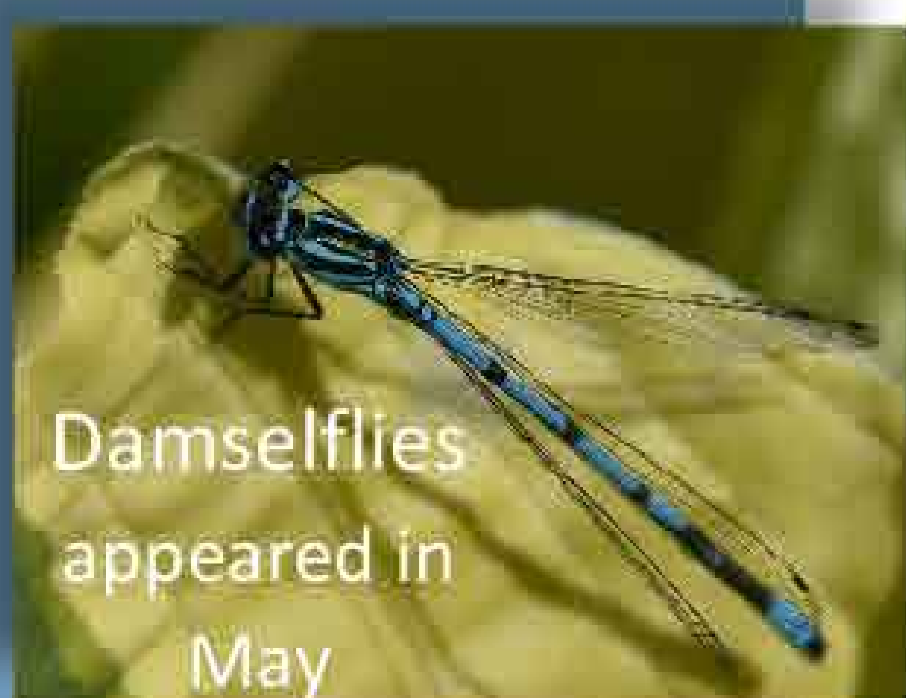
Damselflies appeared in May

FUN & GAMES Games and facts to keep you amused